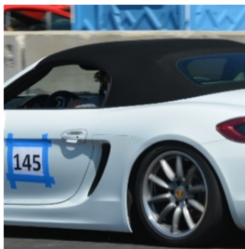
On the Track