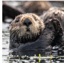
On the Track

Get the details on Monterey Bay's Concours in Paradise , October 25, 2020.