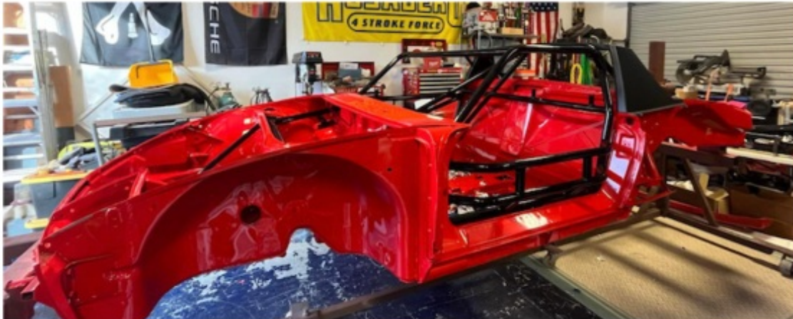
Back home in the shop