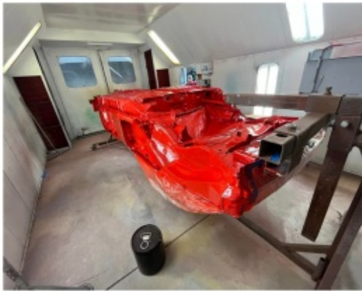
The base red color applied "everywhere".