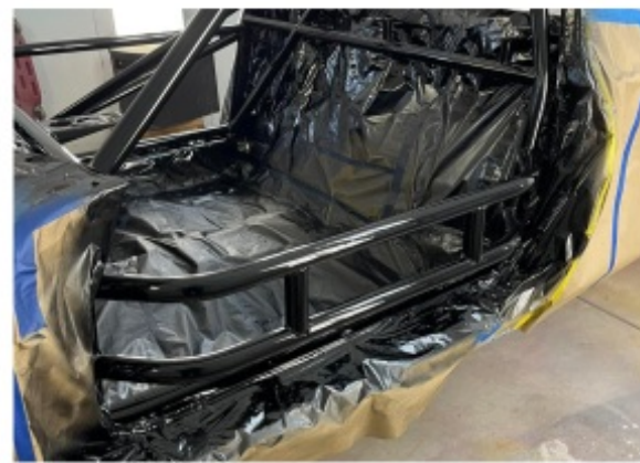
The roll cage in black.